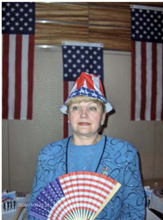
USA Elections, November 4, 2008