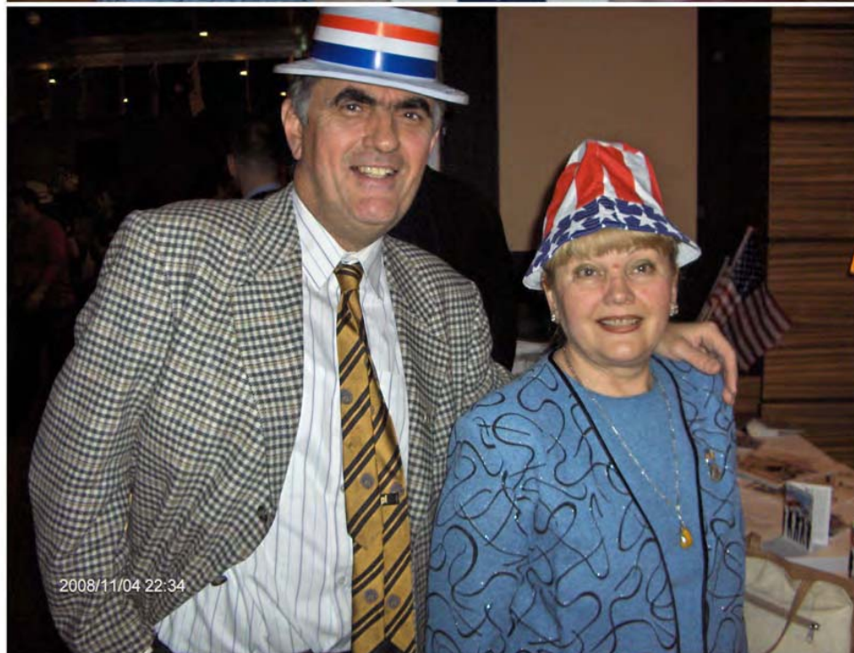
USA Elections, November 4, 2008